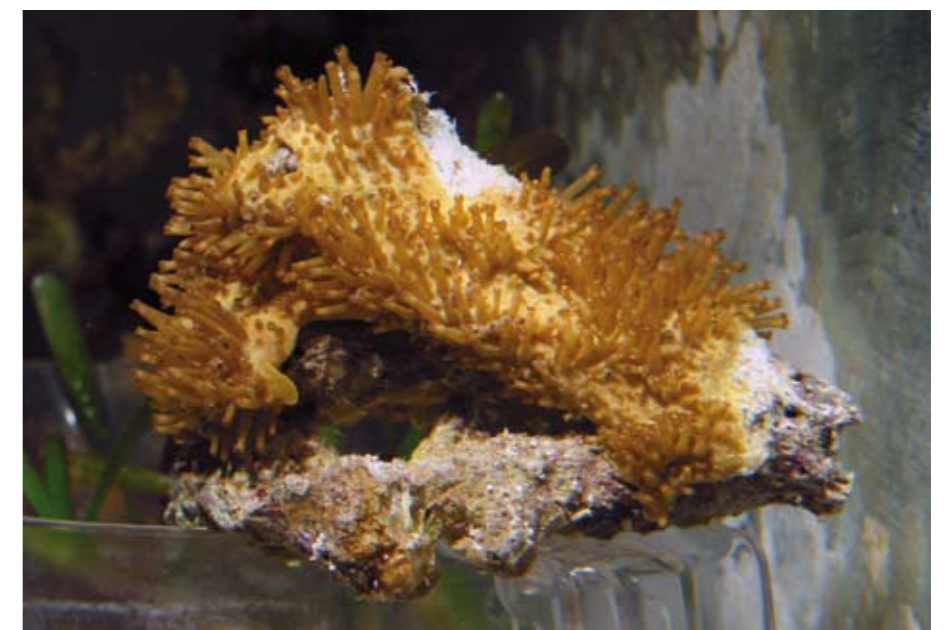
Poor polyp extension - shown here - on newly imported specimens is often an indication of inadequate water flow.