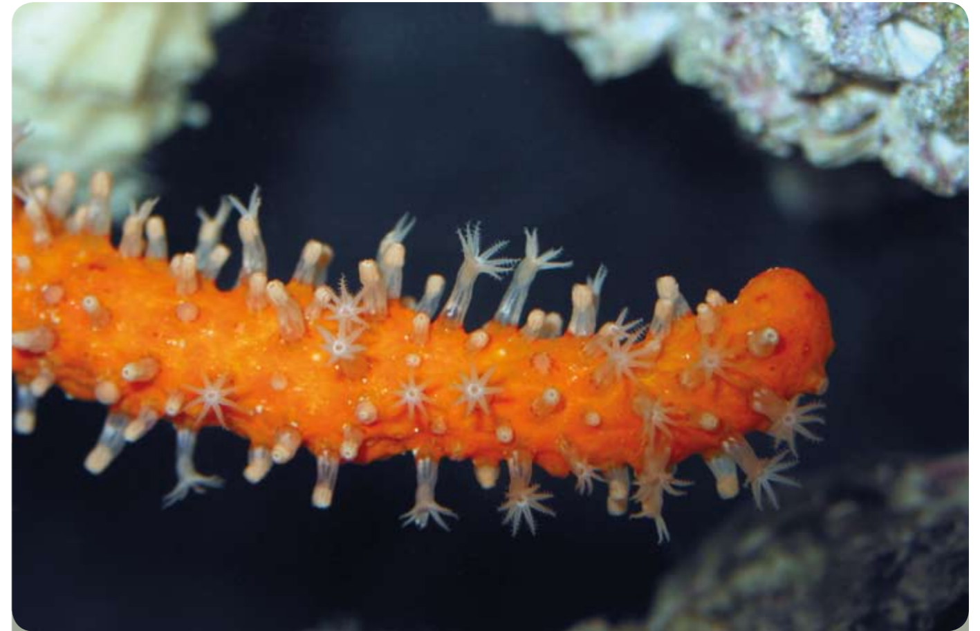
The polyps of Paraminabea are relatively large and will accept some of the new and improving plankton substitutes manufactured today. Nanoplankton is not required for this non-photosynthetic coral.

Like many other night-feeding (azooxanthellate) planktivorous corals, Paraminabea needs to be suspended upside down in the aquarium for best success