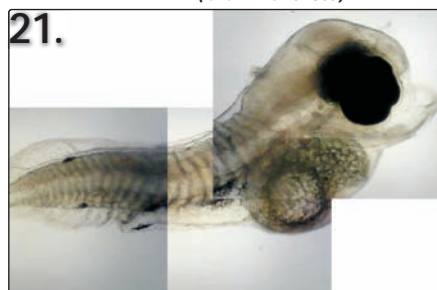
▲ Front Cover image: Royal Gramma ( Gramma loreto )